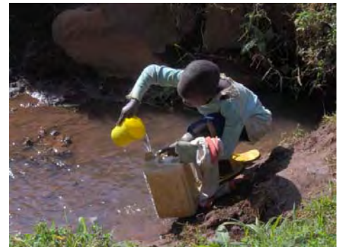
Child obtaining drinking water for his family from a river.

Water from rivers and creeks is readily available. A chlorination system that kills bacteria and viruses in the water has already been donated to the church. This year's team will help the church build a water filtration unit that will remove parasites from the water. The two systems used together will provide 100% safe drinking water.