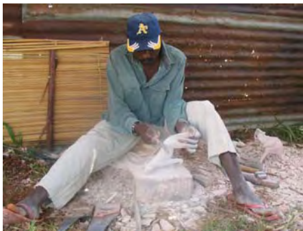
Soapstone, which is found in the area of Tabaka, provides a reasonable resource for the carving industry.

Lack of infrastructure such as electricity, telecommunications and good roads inhibit the full use of resources. Yet cell phones abound and are often recharged by using a solar panel and a car battery. In spite of the abundance of crops, the hilly nature of the district leads to serious soil erosion and makes road travel difficult, especially in the rainy season when many roads (only 10% of which are paved) become impassable.