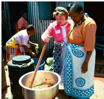
The relationships you experience during a mission trip will stay with you forever!

If you cannot go yourself, we ask that you pray about helping others to go or to help with the costs of the workshops and ministry outreaches. It will be an investment that will make a difference right now and will also have eternal returns!