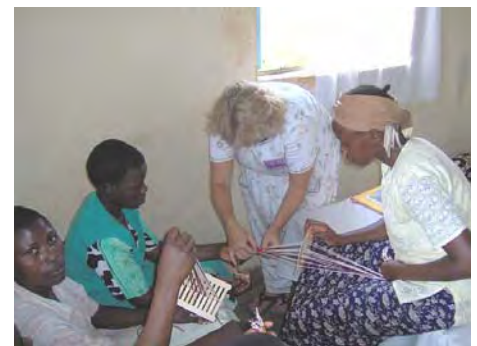
Cottage Industry Workshop—Weaving and Crocheting

LEAMIS team members can have a major impact in the area we will be serving. In addition to sharing the love of Christ as we fellowship with the orphans, widows, and others in the church and community, we have an opportunity to share skills and knowledge through the cottage industry workshops.