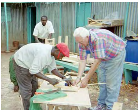
Cottage Industry Workshop—Carpentry

Cottage Industry workshops provide an introduction to things that can be used to start a home business. What we may only consider to be a hobby can be developed into a program that can provide a valuable source of income for families or the church.