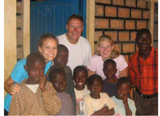
Three of last year's team members with a group of orphans.

to the those who go who are willing to minister to the children.